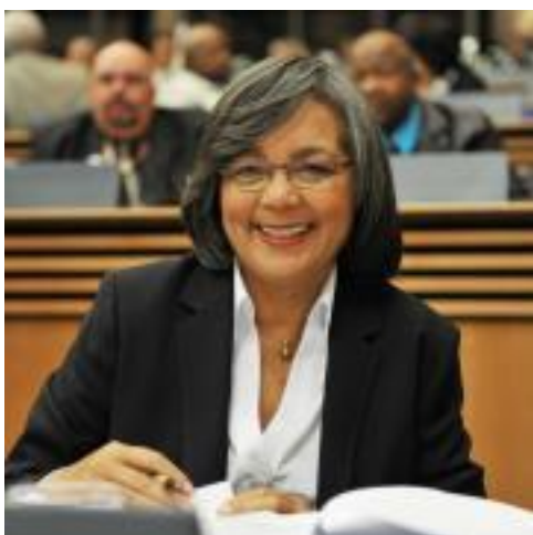
Patricia de Lille Commissioner; Minister of Public Works and Infrastructure