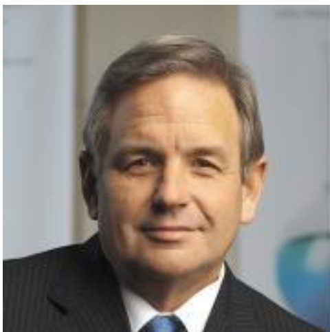
Chad O. Holliday

Commissioner, Finance Minister of Indonesia