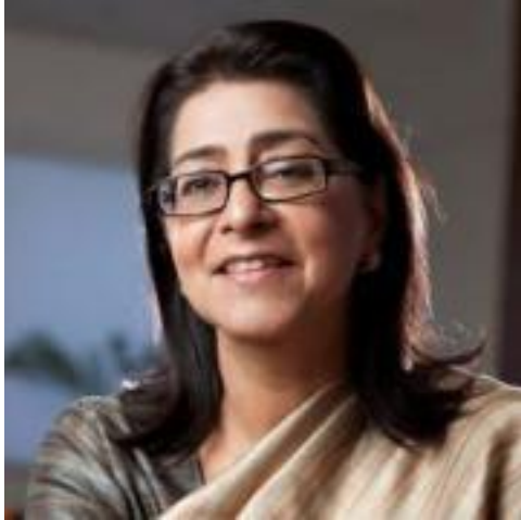
Naina Lal Kidwai

Commissioner; Chairman, Advent Private Equity India Advisory Board; Non-Executive Director, boards of LafargeHolcim, Max Financial Services, CIPLA, Nayara Energy and Larsen and Toubro; Past President, FICCI