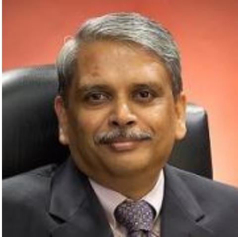
S. (Kris) Gopalakrishnan

Former Commissioner; Co-Founder and Former Executive Vice Chairman, Infosys; Chairman of Axilor Ventures