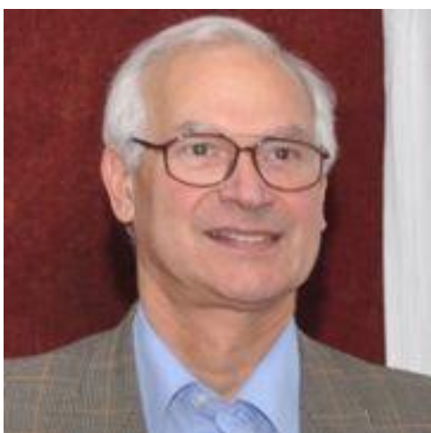
Jamshyd Godrej Chairman and Managing Director, Godrej & Boyce Mfg Co. Ltd.