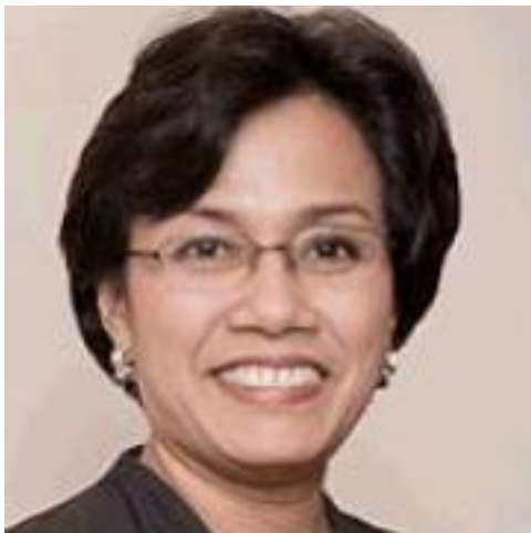
Sri Mulyani Indrawati

Commissioner; Professor, University of Cape Town; Visiting Professor, Sciences Po, Paris; Associate Fellow in the Africa Programme and Chatham House