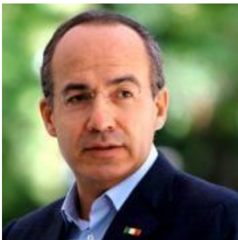
Felipe Calderón Hinojosa

Co-Chair; IG Patel Professor of Economics and Government at the London School of Economics and President of the Royal Economic Society