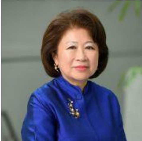
Mari Elka Pangestu

The Global Commission on the Economy and Climate has benefitted from the expertise and contributions of many distinguished members. We thank the following members of the Commission for their work helping shape policy for better economic growth and a better climate up until the Commission closed at the end of 2022.