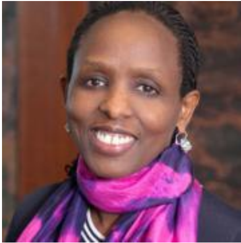
Dr. Agnes Kalibata

Commissioner; Baron Green of Hurstpierpoint; Chairman, Asia House